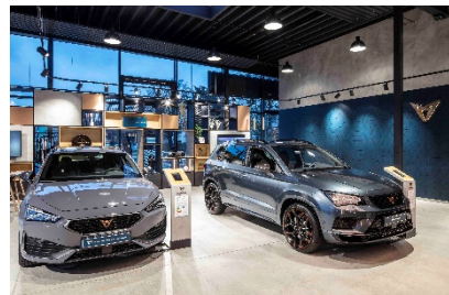
SEAT Cupra, Düsseldorf