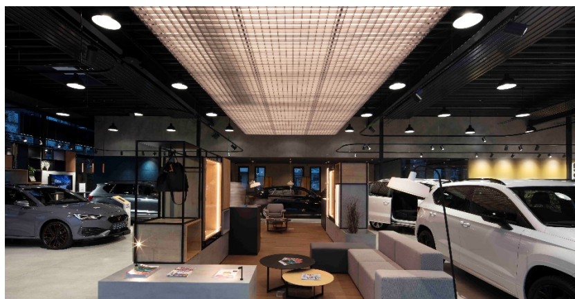
SEAT Cupra, Düsseldorf